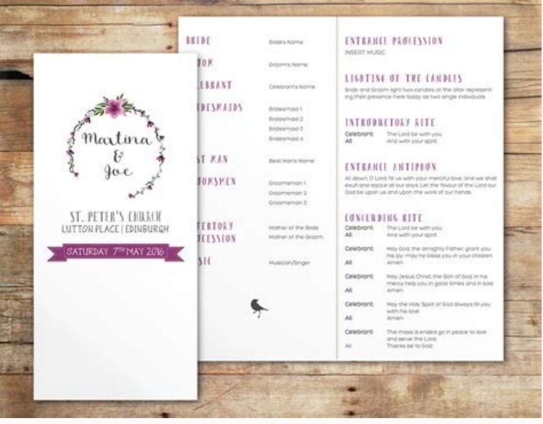
Order of service catholic wedding without mass template.